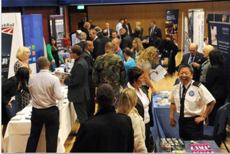
Connecting ex-Forces candidates with employers at a BFRS Event