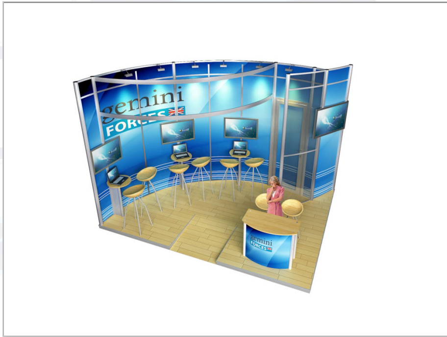
A virtual booth at the BFRS Virtual Event